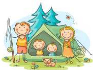
Camp Cedar edge