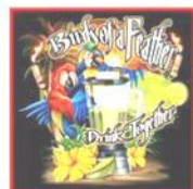
1024 Black Only