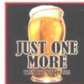
1014 Black Only

View shirt designs in color at the Aerie or the digital edition of the Eagle Pride online at eaglesaerie595.com.