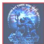
1034 Navy Only