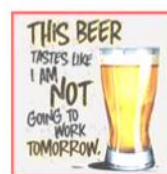
1033 Grey Only