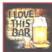
1026 Black Only