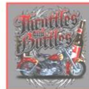
1011 Charcoal Grey Only