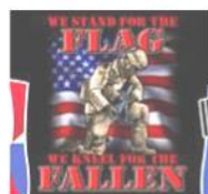
2018-A Black Only