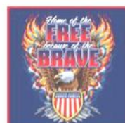
1009 Navy Only