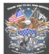
2019-A Black Only